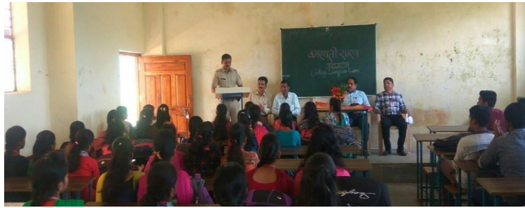
Opening Ceremony of Garden Technique